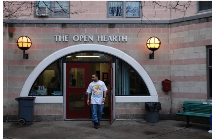
Main Entrance at 150 Charter Oak Ave. Hartford, CT

Development Coordinator at The Open Hearth